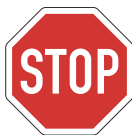
Stop! Give priority