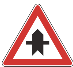
Priority at the next junction