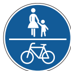
Shared pavement and cycle path

Cyclists are allowed to use some pavements , and sometimes they can use pedestrian zones as well. However, there must be a road sign there that indicates they are allowed to do so. It is particularly important for both cyclists and pedestrians to show each other consideration here.